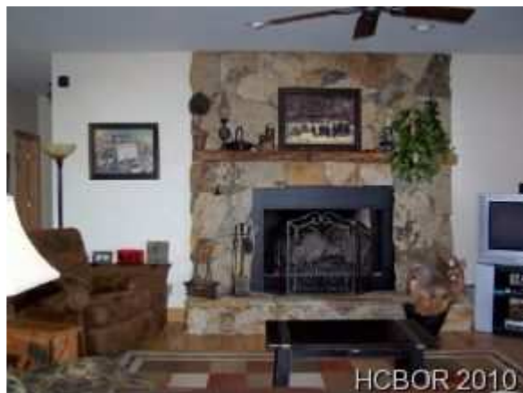
Great room fireplace