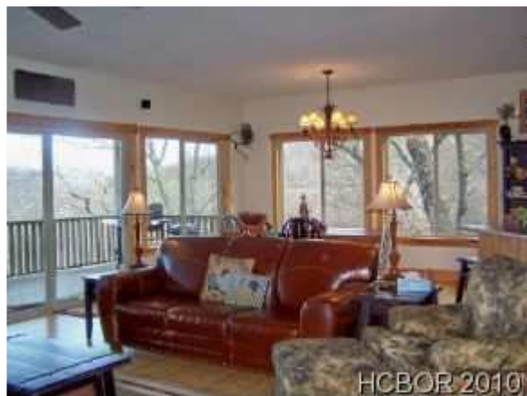
Great room right

--- Information herein deemed reliable but not guaranteed. ---