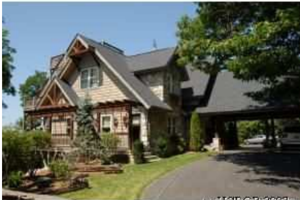
Coming In HOBBIT 2009