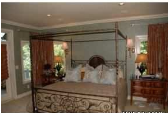
Master HOBBIT 2009