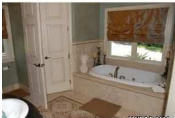
Bath HOBBIT 2009