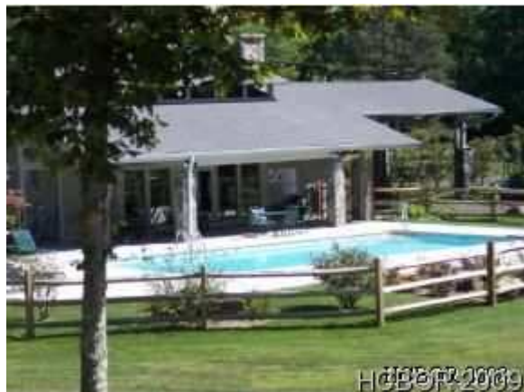
Pool HOBBIT 2009

--- Information herein deemed reliable but not guaranteed. Copyright 2007 Highlands-Cashiers Board of REALTORS, Inc.03/15/2009 02:36 PM ---