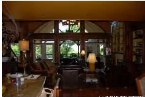
Living Room HOBBIT 2009