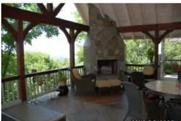
Outside fireplace HOBBIT 2009