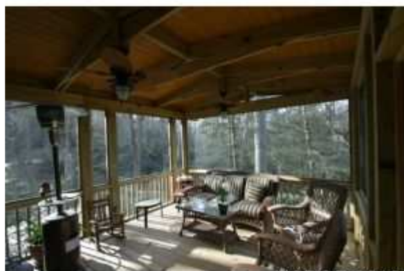
Covered Deck HCBOR 2010