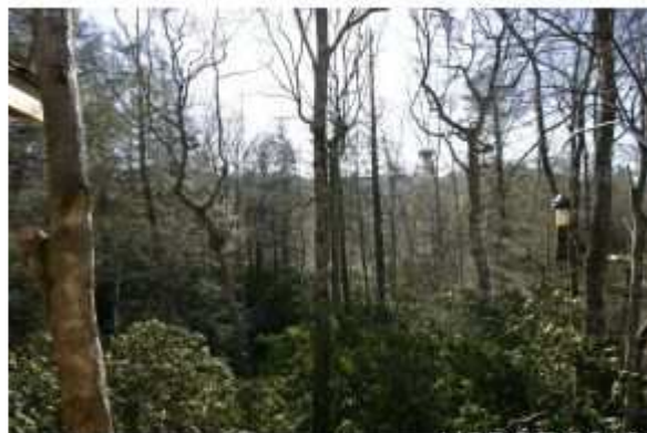
deck HCBOR 2010