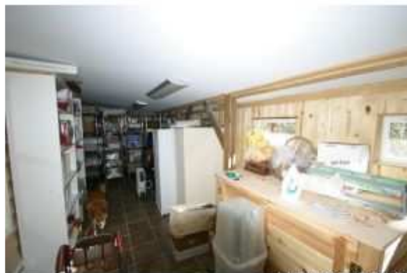
storage HCBOR 2010