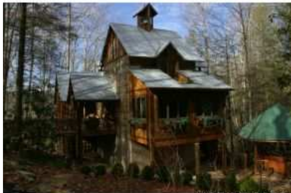
Main House HCBOR 2008