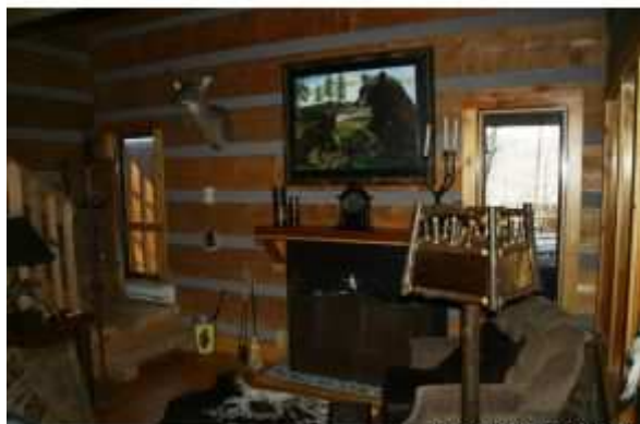
Living Room HCBOR 2008