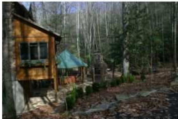
Patio HCBOR 2008