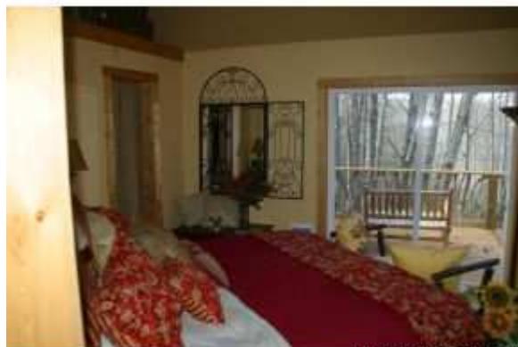
Master Bedroom HCBOR 2008

--- Information herein deemed reliable but not guaranteed. Copyright 2007 Highlands-Cashiers Board of REALTORS, Inc.12/14/2008 07:53 AM ---