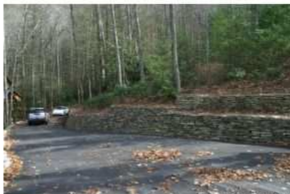
Stacked Stone HCBOR 2008