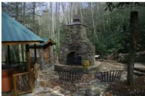
Fireplace HCBOR 2008